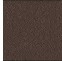
Chocolate (SC4) 2-DAY