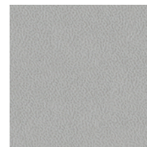
Sterling (SC18) 3-WEEK

2 DAY COLORS: 5 colors with a standard 2-day lead time.