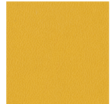
Honeycomb (SC16) 3-WEEK