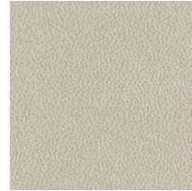
Pebble (SC9) 2-DAY