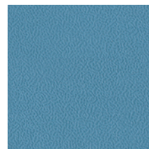
Lagoon (SC15) 3-WEEK