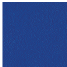
Blue (SC14) 3-WEEK