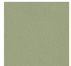
Sage (SC17) 3-WEEK