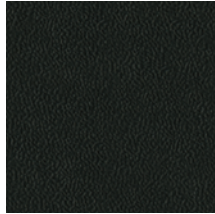
Black (SC1) 2-DAY