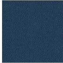
Navy (SC5) 2-DAY