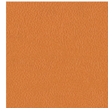
Carotene (SC13) 3-WEEK