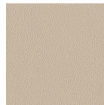
Bisque (SC7) 3-WEEK