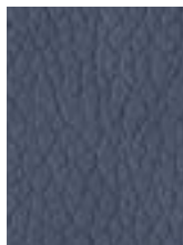
Pacific Blue FL3003