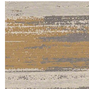
Mixed Metals ZH-FW3